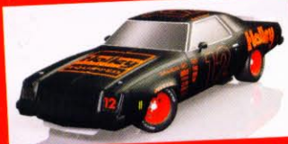
NASCAR-STYLE '75 LAGUNA